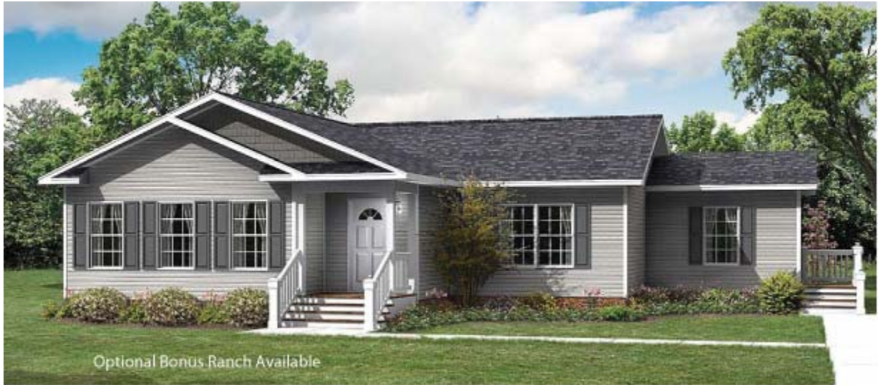
Optional Bonus Ranch Available