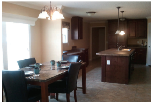
Challenger 32 x 66 by ScotBilt