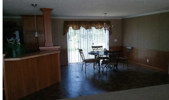
Challenger 28 x 56 by ScotBilt