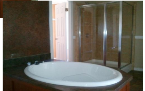
Dutch 32 x 66 by Champion